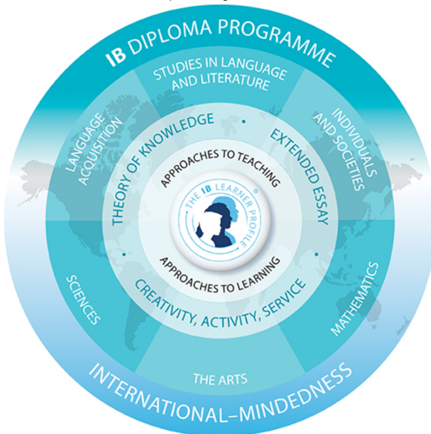
The Diploma Programme model